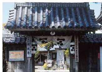
2 Enseiji Temple

It holds and exhibits a variety of historical artifacts related to Hagi. A short movie about the Choshu Five introduces their contributions.