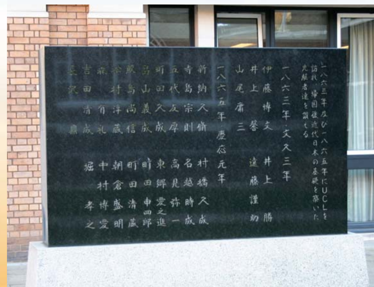
Memorial stone inscribed with the names of Japanese students at University College London

These five young samurai accomplished a remarkable achievement as leaders of various fields in order to build a modern Japan. They are now referred to as the "Choshu Five" in admiration to their contributions.