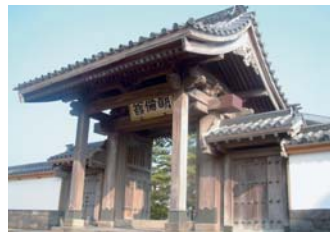
3 Meirinkan - The Hagi Domain School

There are many historic, cultural and natural sites preserved in Hagi by the concept of city planning "Hagi Machijuu Hakubutsukan" (regarding the whole city as an unloofed museum). Travellers can enjoy searching for area associated with Choshu Five.