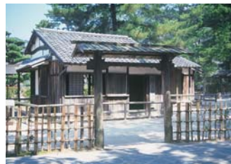
6 Shokasonjoku Private School

It was built in 1925 and has been designated a registered national tangible cultural property. It exhibits photographs and other things regarding Masaru Inoue as a memory of his contributions to the Japanese railways.