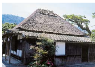
7 Former residence of Hirobumi Ito

Shoin Yoshida educated people who contributed to the Meiji Restoration, such as Hirobumi Ito, Genzui Kusaka and Shinsaku Takasugi in this small building. Hirobumi Ito was deeply affected by Shoin Yoshida. It is a national historical site.