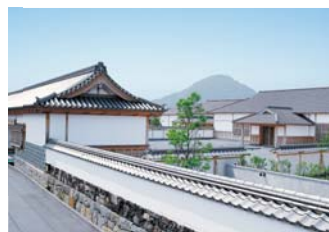
1 Hagi Museum

Inoue's father, Katsuyuki, assumed leadership of Ogumi (a senior rank retainer of Hagi Domain). Masaru was influenced by his father who had the experience of living in Nagasaki and opportunities to study Western learning.