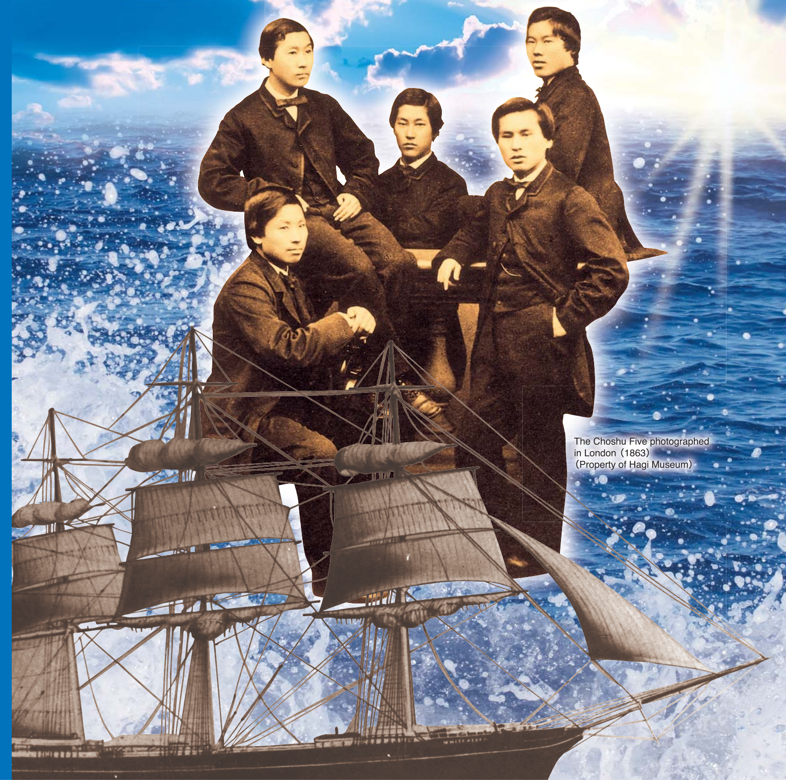
The Choshu Five photographed in London (1863)

Five samurai from the Hagi domain who took up the challenge of Japanese modernization