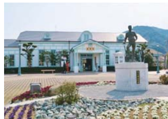
5 JR Hagi Station

Hirobumi Ito used to study reading and writing here at the age of 11. It is also said that Shinsaku Takasugi used to play at this temple when he was a child.