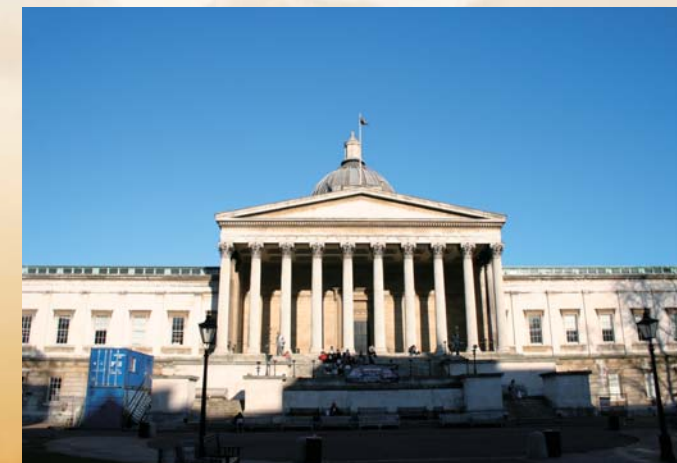
University College London where the Choshu Five studied.

The names of the twenty four samurai dispatched by Hagi and Satsuma Domain are carved on it.