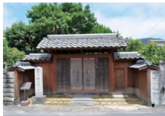
4 Former residence of Masaru Inoue

It was called "Number One In Western Japan" due to its high level of education at that time. Kaoru Inoue and Masaru Inoue used to study at this school.