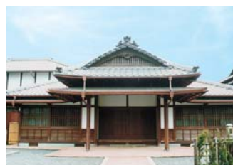
8 Villa of Hirobumi Ito

Hirobumi Ito lived here between 1854 and 1868 until he became the prefectural governor of Hyogo. Here, Hirobumi Ito grew as a student of Shoin Yoshida.