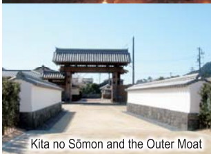
Kita no Sōmon and the Outer Moat