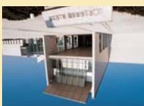
the Outer Moat