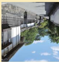
the Outer Moat