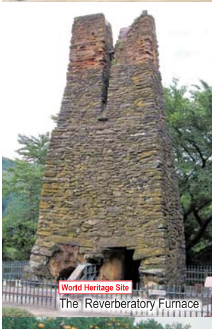
World Heritage Site The Reverberatory Furnace