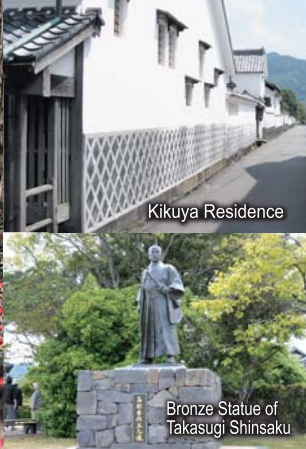
Summer Oranges and Mud Walls