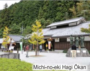
Michi-no-eki Hagi Ōkan