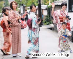
Kimono Week in Hagi

Hagi Onsen and Ryokan Association ☎758-0044 Hagi City, Karahi- machi 11 ☎ (0838) 22-7599 http://www.hagi.ne.jp/