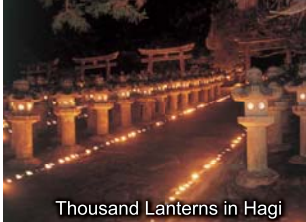
Thousand Lanterns in Hagi