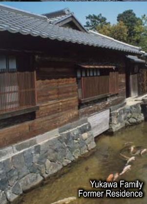
Yukawa Family Former Residence