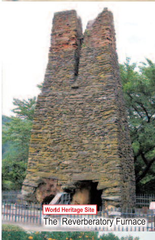
World Heritage Site The Reverberatory Furnace