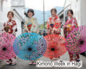
Kimono Week in Hagi