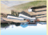
The private school led by Yoshida Shōin for young people who helped to push forward the Meiji Revolution, such as Takasugi Shinsaku, studied here.