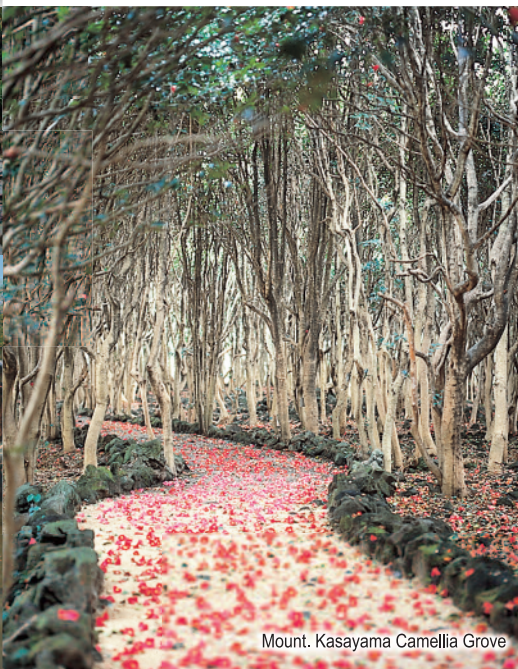
Mount. Kasayama Camellia Grove