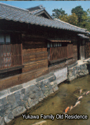
Yukawa Family Old Residence