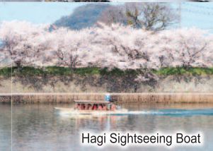
Hagi Sightseeing Boat