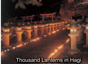
Thousand Lanterns in Hagi