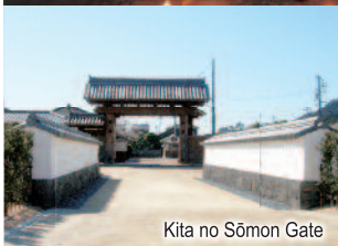
Kita no Sōmon Gate