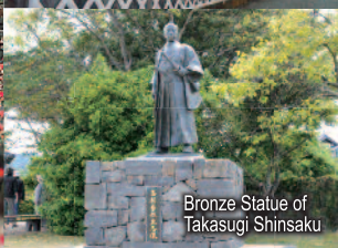
Bronze Statue of Takasugi Shinsaku