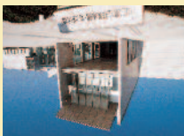
Built to house the donated collection of Hagi local, Uragami Toshio. The collection includes wood block prints by Utagawa Hiroshige and Katsushika Hokusai.