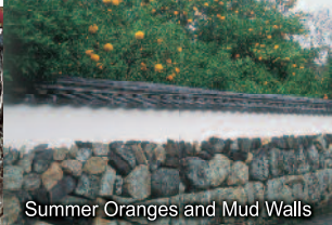
Summer Oranges and Mud Walls