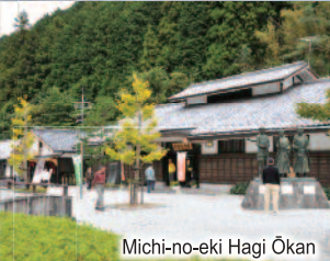
Michi-no-eki Hagi Ōkan